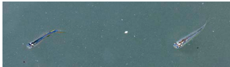
Neon Blue-eye Pseudomugil cyanodorsalis in a shallow mud puddle in the mangroves.

Enjoy this edition and we'll see you at the next meeting on Friday 6 th October for a relaxed evening of fun, bidding, driving prices up for your bidding mates, chat time and catching up with fellow fishos!