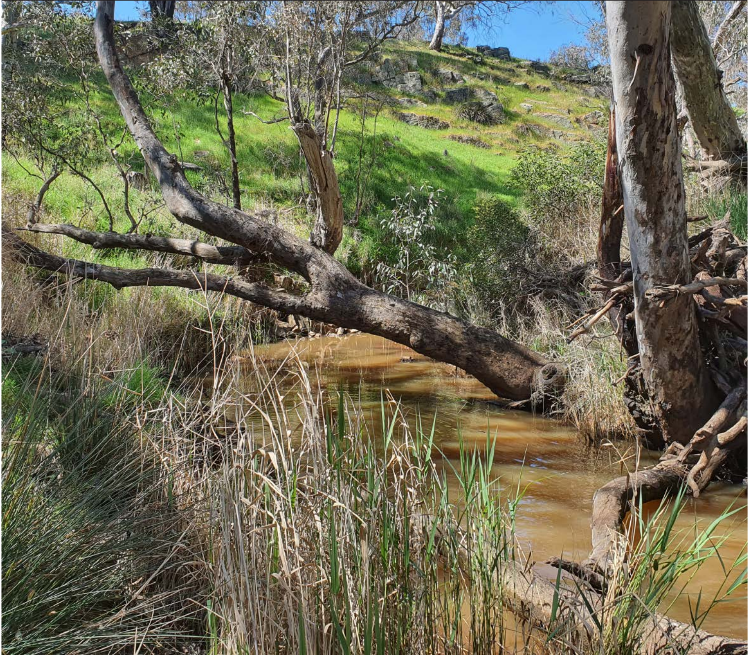
Above and below right: Axe Creek, Bendigo.

Another great milestone with the release of 1,650 Southern Purple-spotted Gudgeon juveniles into four sites. The majority of the juveniles were released along Axe Creek near Bendigo where it is hoped they will become a self-sustaining population with lots of instream woody structure, rocky gorges and aquatic vegetation.