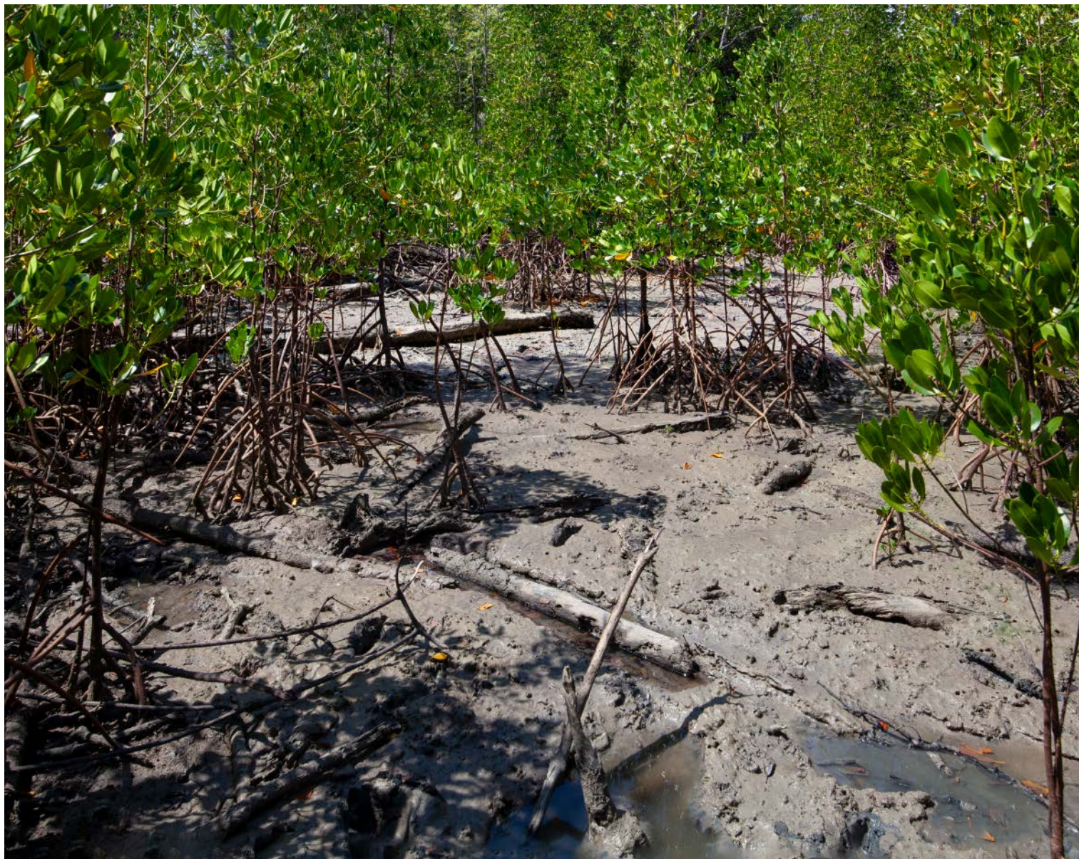
Above: Mangrove tidal mud on Milingimbi Island, East Arnhem Land NT, home to Neon Blue-eye Pseudomugil cyanodorsalis .