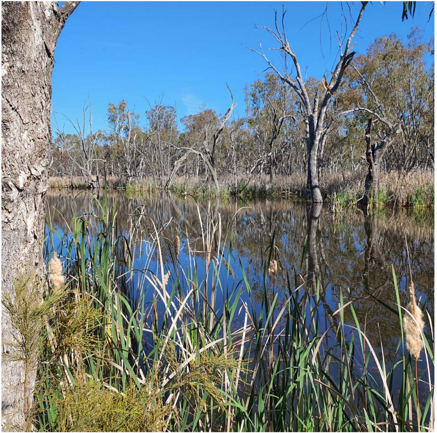
Above: Camerons Creek, Bendigo. Below: Goulburn River lagoon.