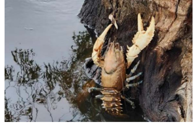
A Murray River Spiny Crayfish climbs a tree to escape the blackwater.

Dion and Jackson Lamin have been involved in extensive fish and crayfish rescue operations during the recent Murray River flood event.