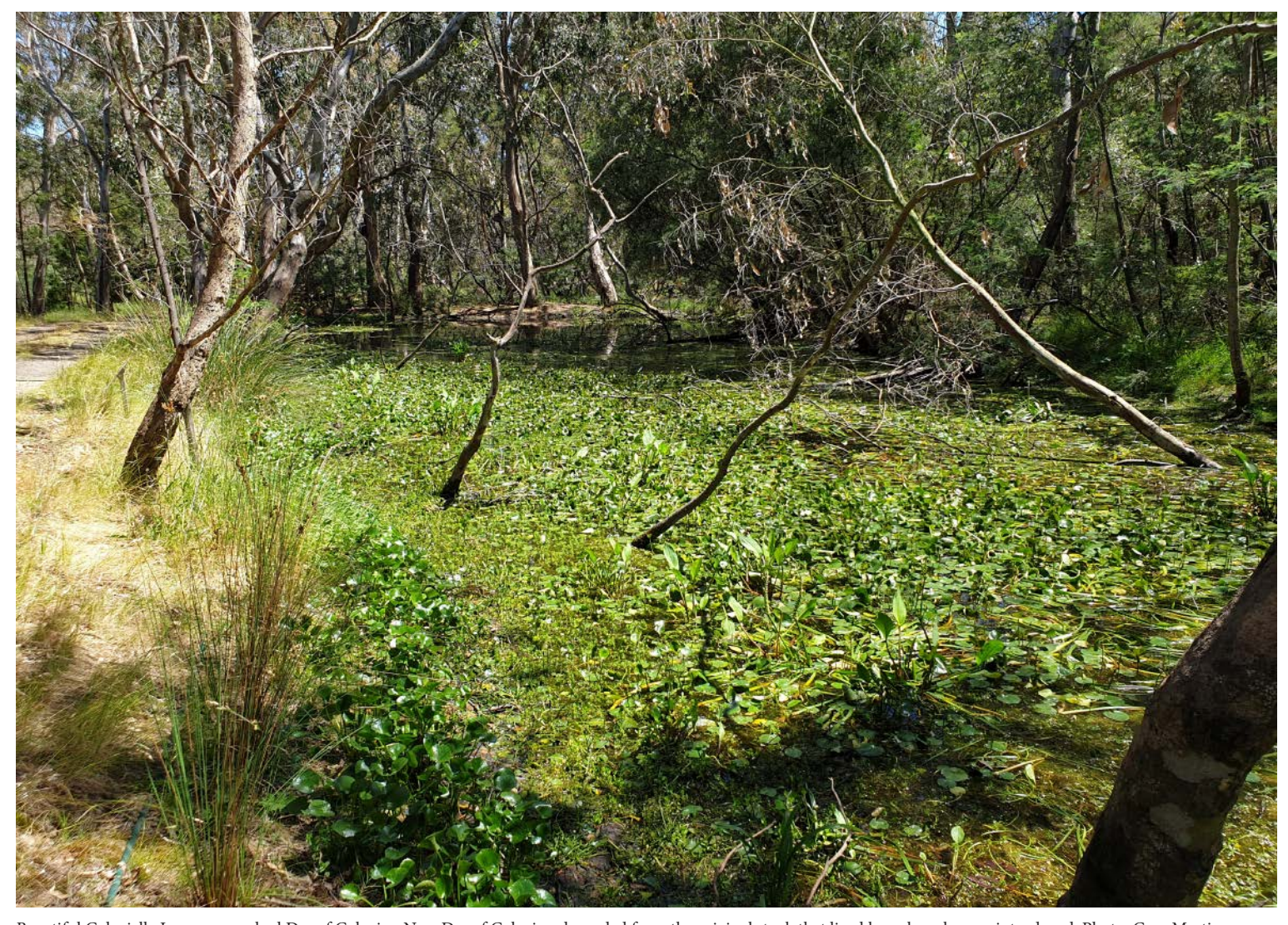
Beautiful Galaxiella Lagoon once had Dwarf Galaxias. Now Dwarf Galaxias, decended from the original stock that lived here, have been reintroduced.