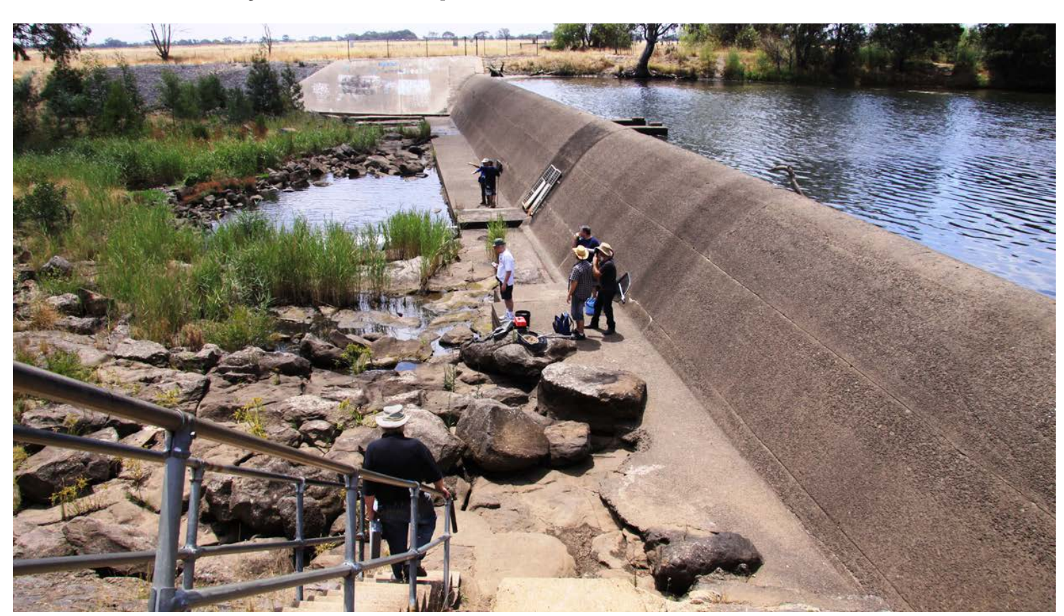
The weir at Centennial Park on the Werribee River. The weir is a major barrier to fishes movements/migration and several species congregate at the base of the wall. This photo was taken on an ANGFA Vic field trip in January 2014, and it will be great to go back after 9 years.

Enjoy this edition and we'll see you at the next meeting on Friday 3^{\rm rd} February!