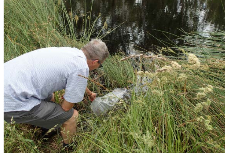
Above: Glenn releasing SPSG. Above: beautiful blue damselflies were seen in profusion at this well established habitat.