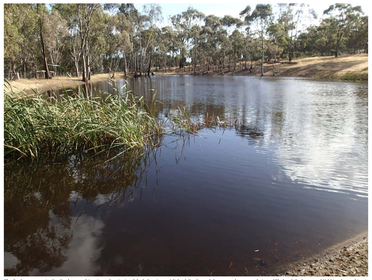
The final surrogate site for the day was this private dam in Axedale, belonging to Michael Gardener. It has a very large population of Flathead Gudgeon and Yabbies. In stocking it with SPSG it is hoped that the Flathead Gudgeon population will eventually be reduced, allowing some Southern Pygmy Perch to survive.