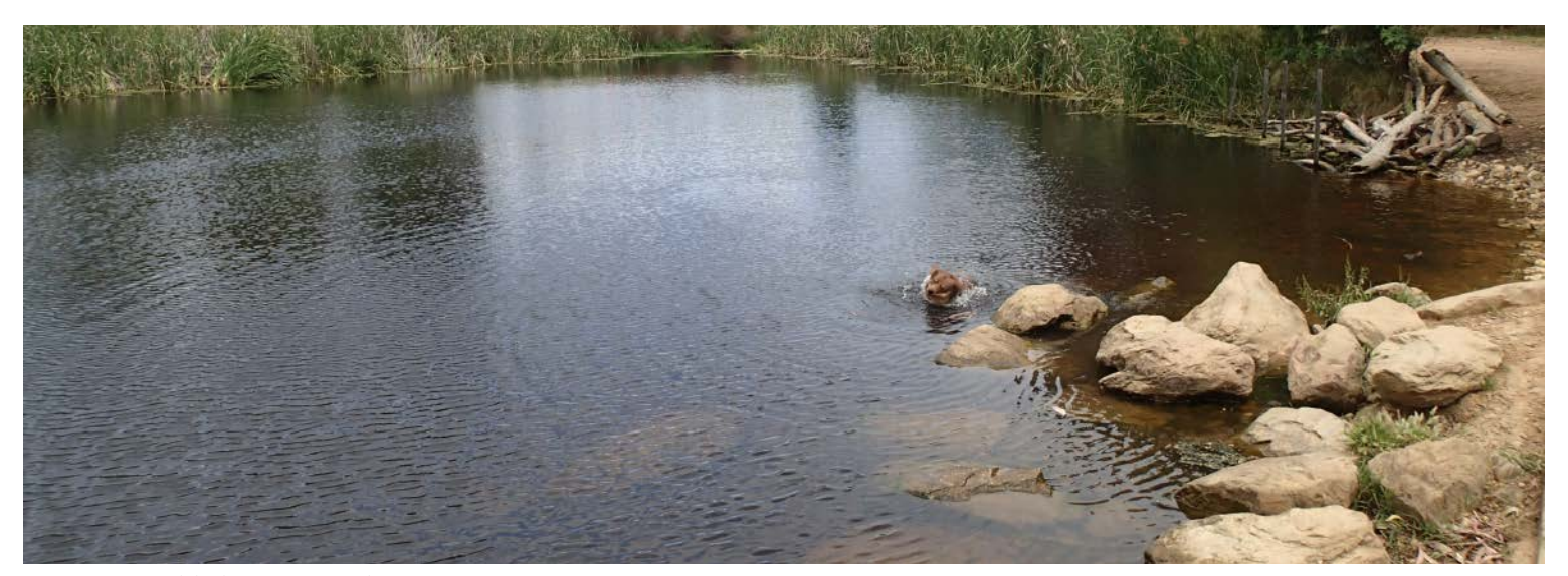
Harcourt Dog Park looking upstream.