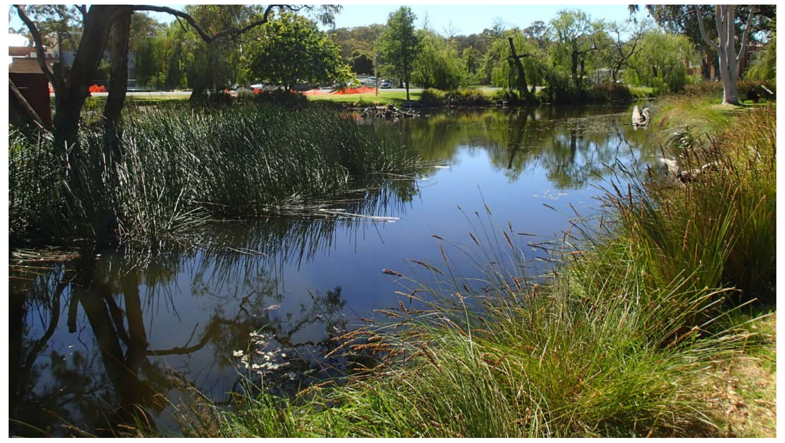
Fish releases day 2. One of the Deniliquin Lagoons - an interconnected string of wetlands designed and constructed by John Conallin.