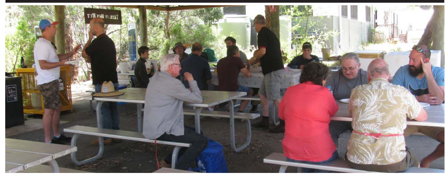
Attendees of the ANGFA Vic end of year BBQ and catch up, held at the Yellow Box Hut, Nangak Tamboree Wildlife Sanctuary, La Trobe Uni.