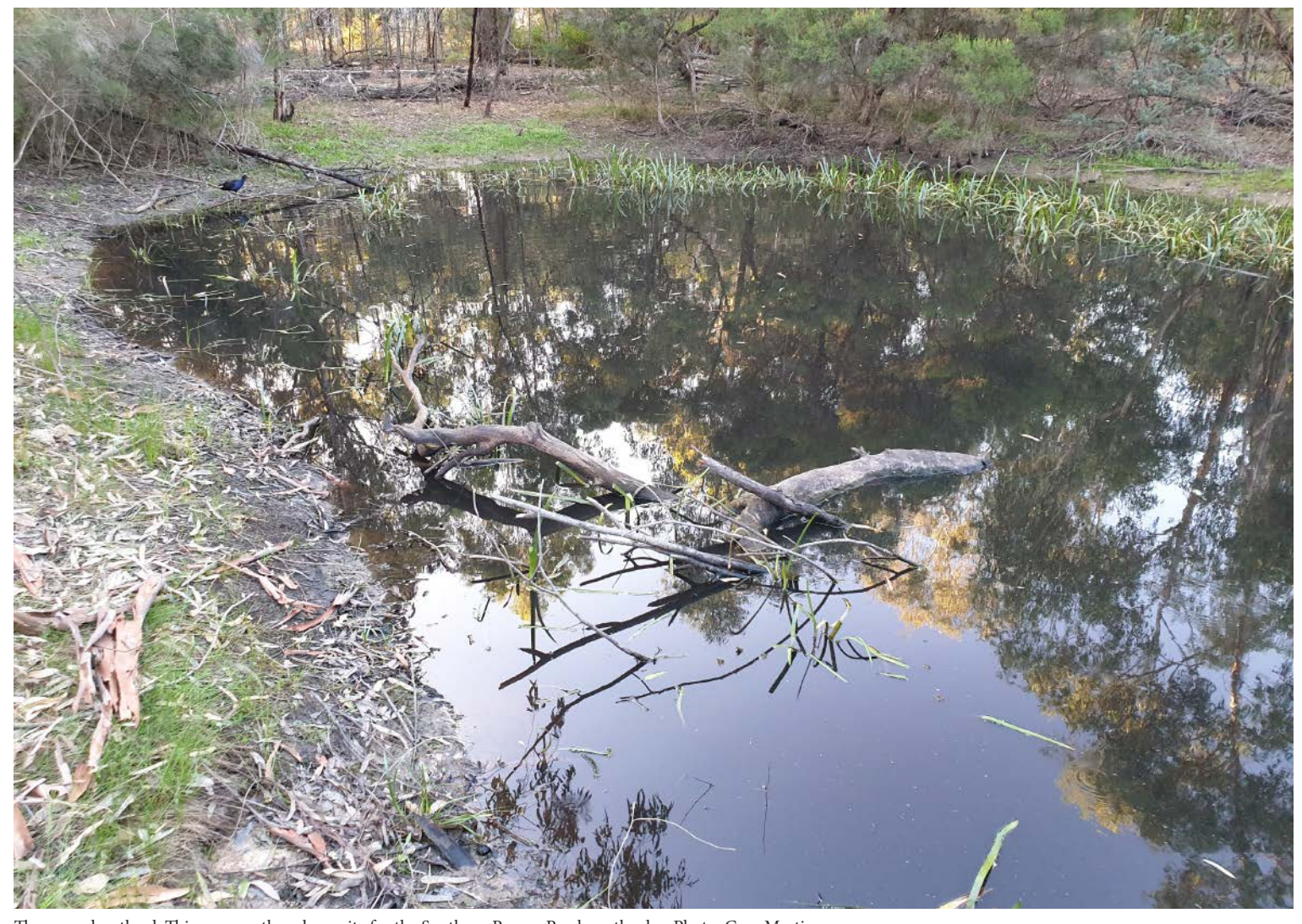
The second wetland. This one was the release site for the Southern Pygmy Perch on the day.