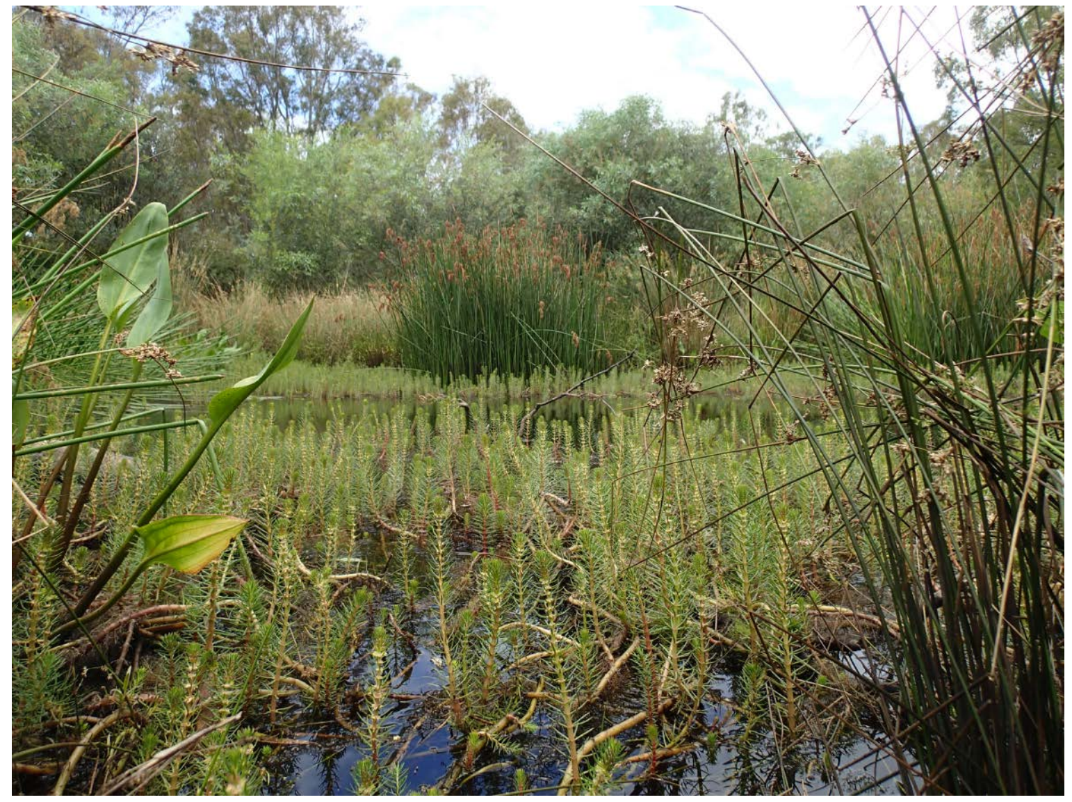
Whittaker Street Wetlands. Enormous diversity of aquatic and marginal vegetation - a superbly restored habitat.