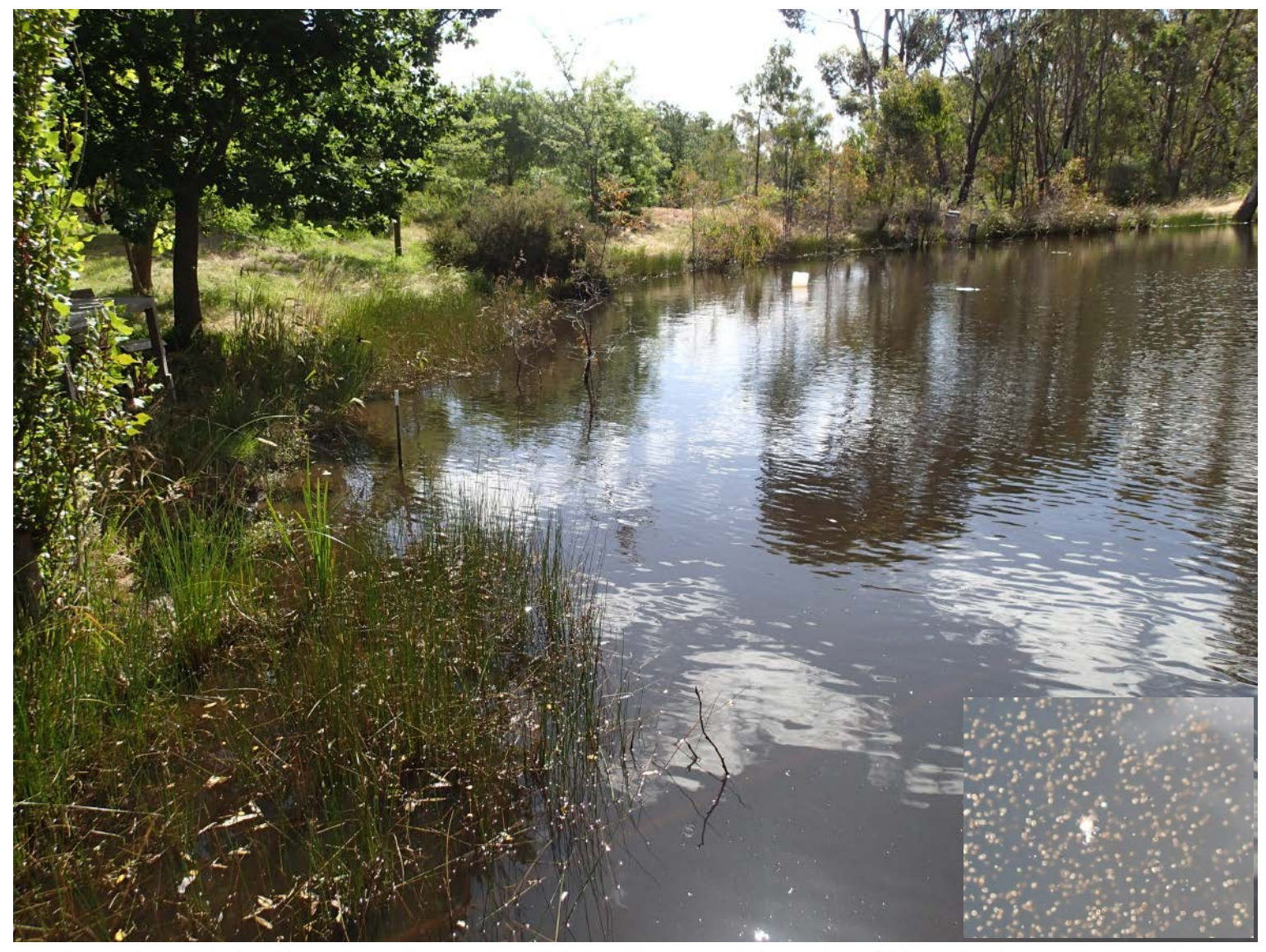
Main photo: another example of a good surrogate site. This private dam in Shelbourne, belonging to Malcolm Swan has no fish but is rich with macroinvertebrates and all manner of living foods. With help from the local LandCare group Malcolm has planted lots of marginal and aquatic vegetation in preparation for stocking with ket local native fishes. (Inset) huge numbers of water mites were seen near the surface of the water.