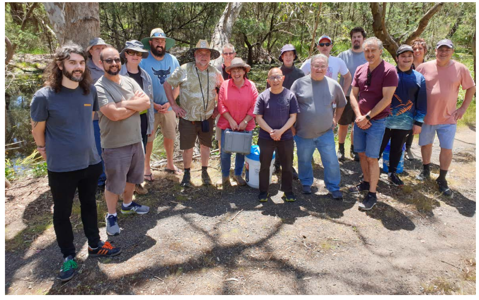
Our BBQ attendees posing for a photo before releasing Dwarf Galaxias into Galaxiella Lagoon, seen behind them in the background.