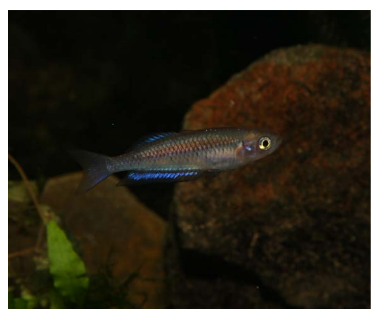
Rhadinocentrus ornatus from Obi Obi Creek.