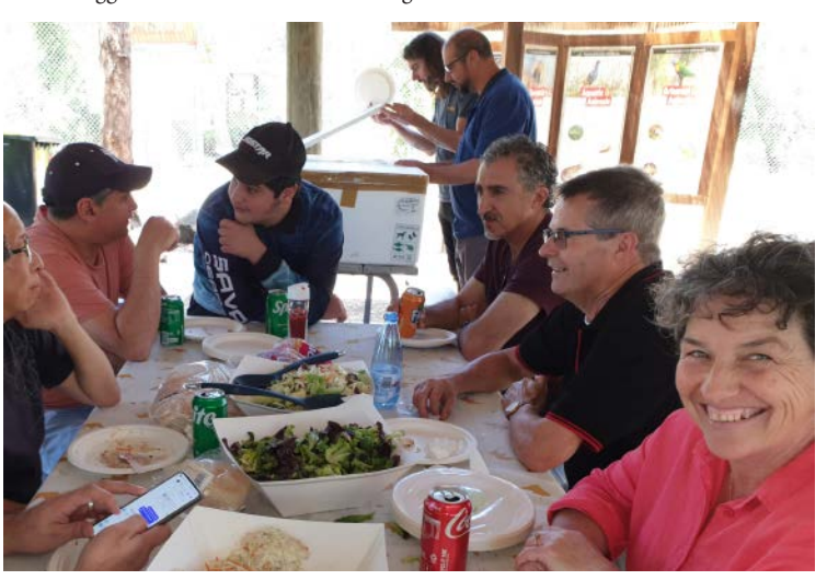
Catching up and sneaking a look at the auction lots...