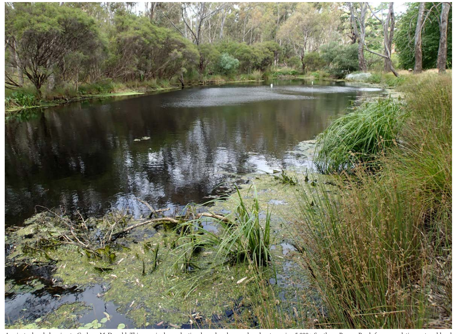
A private dam belonging to Graham McDonald. This amazingly productive dam place has produced a staggering 5,000+ Southern Pygmy Perch for repopulating restored local wetlands since they were introduced into this dam more than a year ago. A good example of a surrogate site working well.