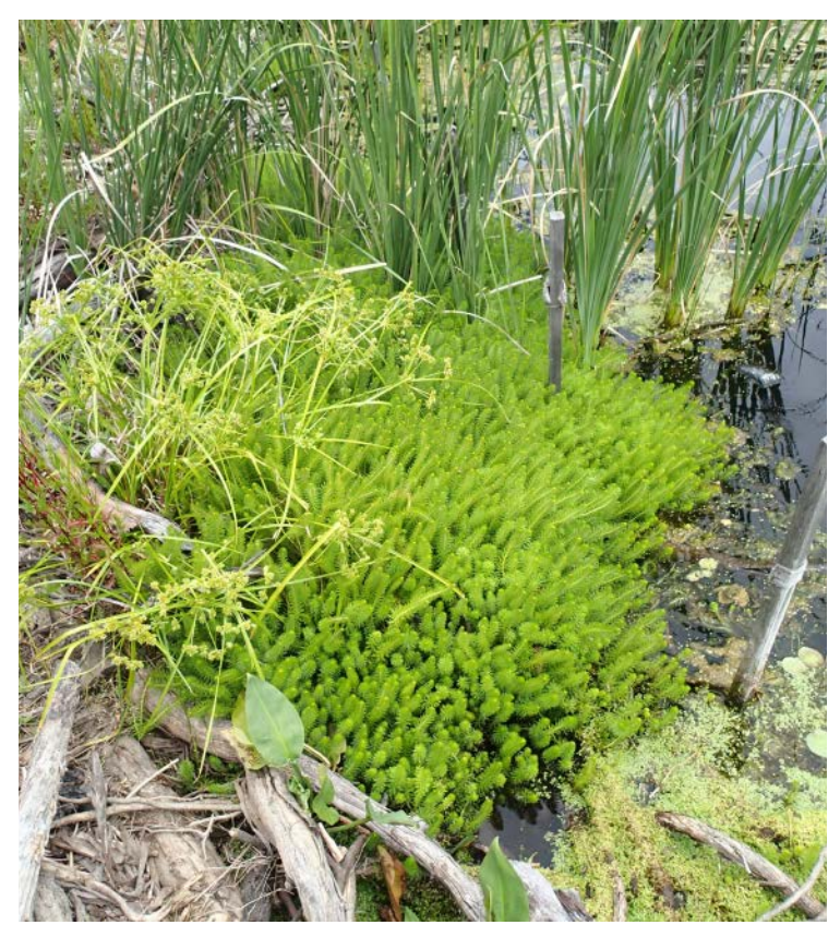
Lush Myriophyllum growth at the Harcourt Dog Park.